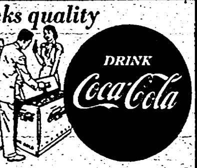
COCA-COLA BOTTLING CORP. of Bakersfield

or WINGATE'S OFFICE SUPPLY 1604 NINETEENTH STREET PHONE 5-5786