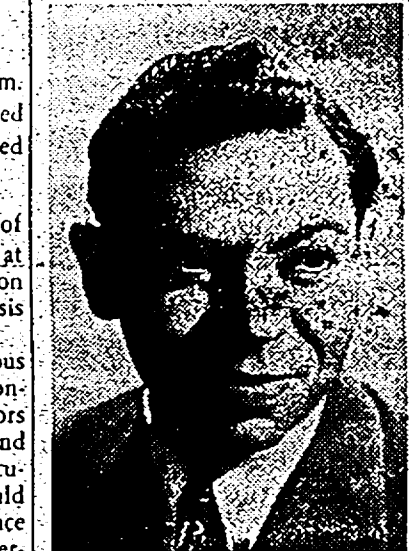
Oscar Levant bridges the gap

Admission to "East Lynne," to be presented in the Little theater of Harvey auditorium, May 14, 15 and 16, will be 50 cents for college students.