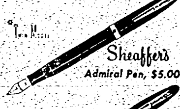
Sheaffers Admiral Pen, $5.00