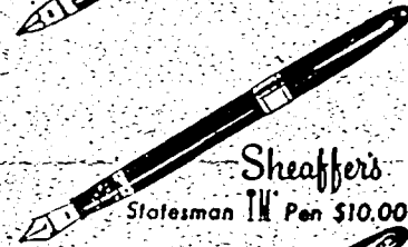
Sheaffers Statesman Pen $10.00