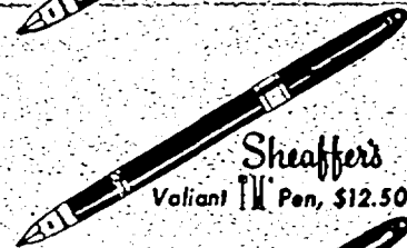
Sheaffers Valiant Pen, $12.50