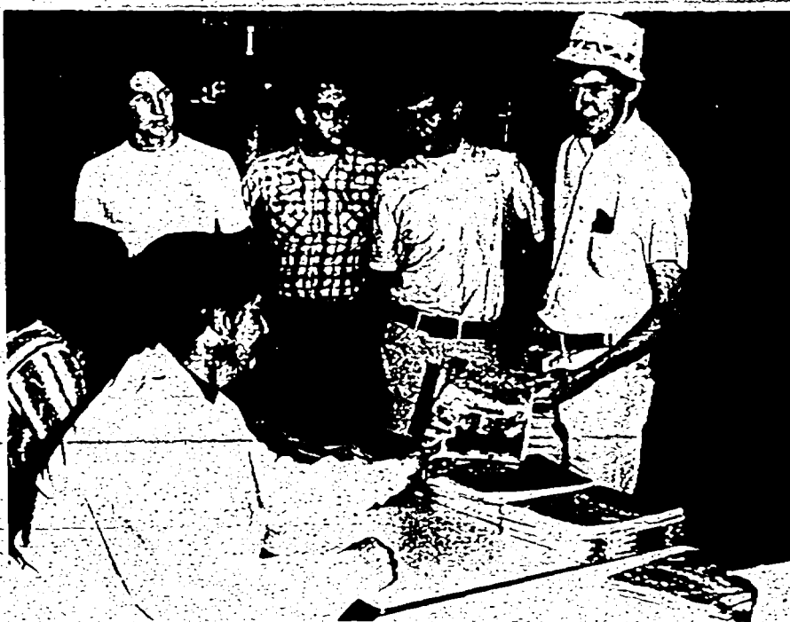
FIRST STOP — This was the scene Thursday in the BC gym as students registered for courses. Their first stop was to pick up their RENE-GUIDE.